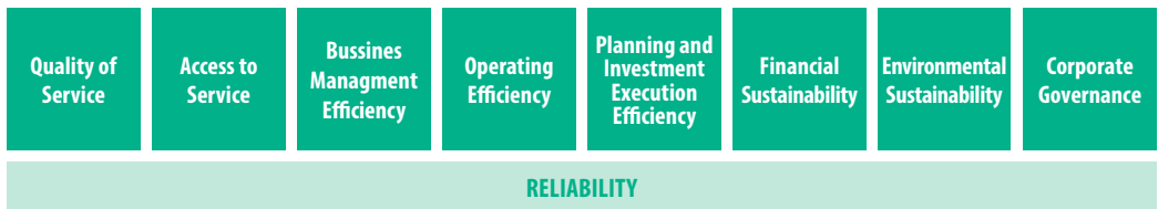
Figure 1 – AquaRating Programme evaluation criteria

The complexity of the model is best shown by the fact that, under these eight rating areas, there are 27 sub-areas, 113 elements for assessment, 61 indicators, 99 variables... E.g. quality of service contains sub-areas CS1 – quality of drinking water, CS2 – distribution of drinking water, CS3 – wastewater collection, CS4 – relations with customers/client service, and each of them has its own performance indicators.