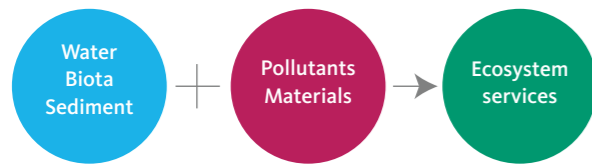
Figure 1. Key flows connect land, water, deltas, coasts and sea.