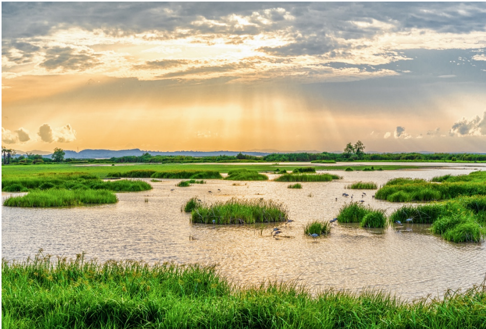
Wetland at Thalaynoi, Thailand.

Looking at Part I, II and III holistically, the chapter attests to the pivotal importance of building strong, polycentric, and inclusive governance systems, which have the capacity to deliver the integrated solutions required for water-wise climate mitigation. Building on that, it is clear that working in silos will fail to deliver the change needed. For our governance systems and national implementation plans to succeed we need to place water in its rightful place: at the heart of all efforts to adapt to, as well as to mitigate climate change.