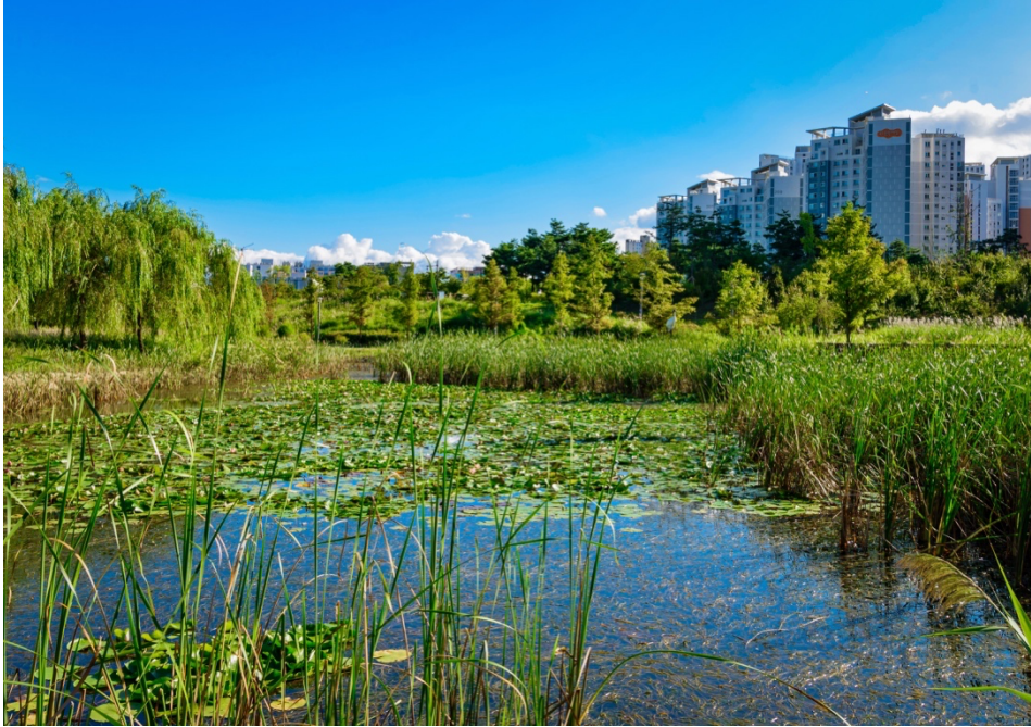
Wild bird wetland park along the Gimpo Han River at Gimpo-si, South Korea.

support water-related mitigation measures. This will require action to foster innovative financing models that can incentivise commercial, as well as non-commercial, sources of funding that can make targeted investments to benefit those most vulnerable. It is critical that the water sector alone does not carry the sole fiscal responsibility for delivering projects upstream with substantial climate mitigation potential.