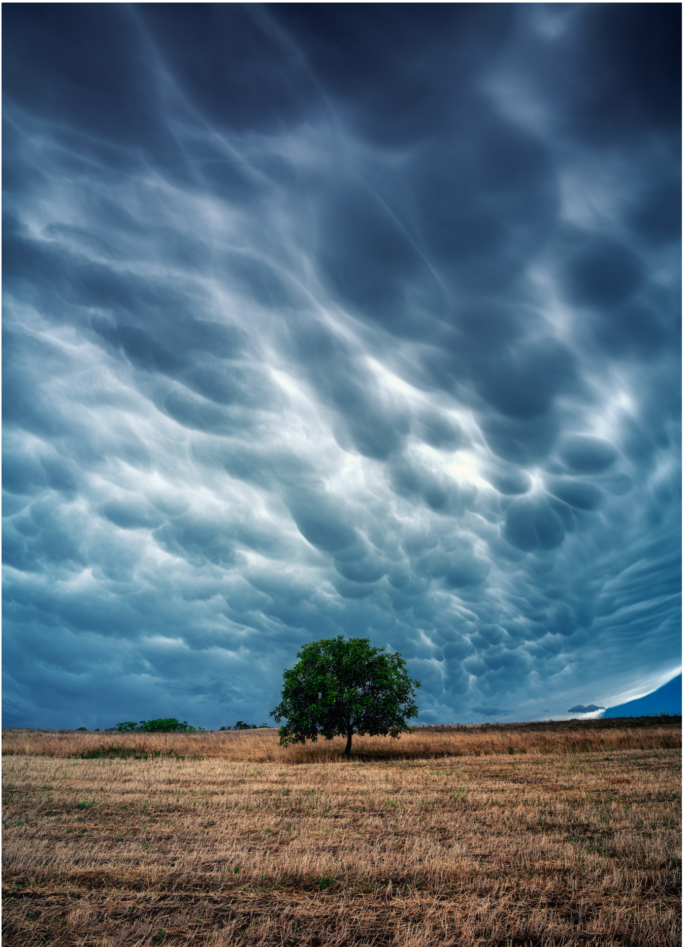
Mammatus clouds gather over parched cropland, Macedonia.